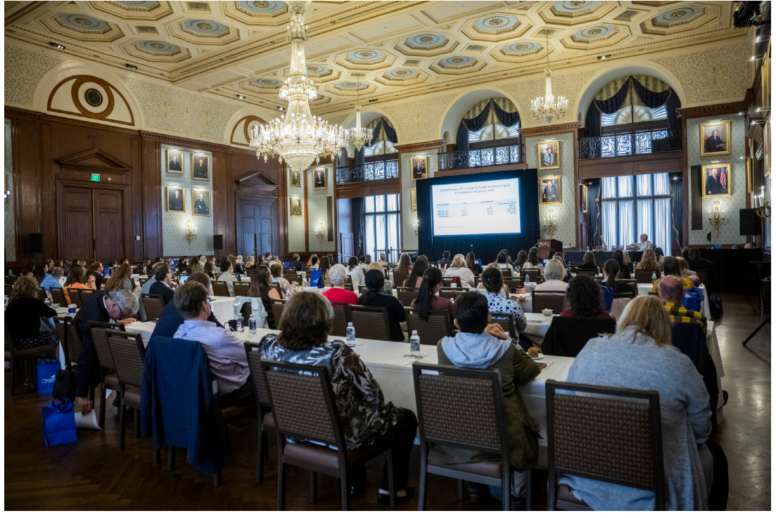
Attendees at the 2022 conference